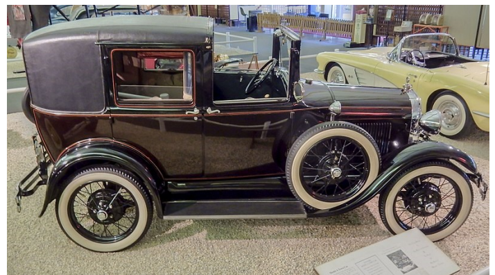
1929 Model A Ford Town Car

Paul Herbert's 1929 4-door's engine is making a loud tapping noise when its under load. The engine has just been rebuilt and the noise is a surprise. Most members went outside after the meeting to try to determine the cause.